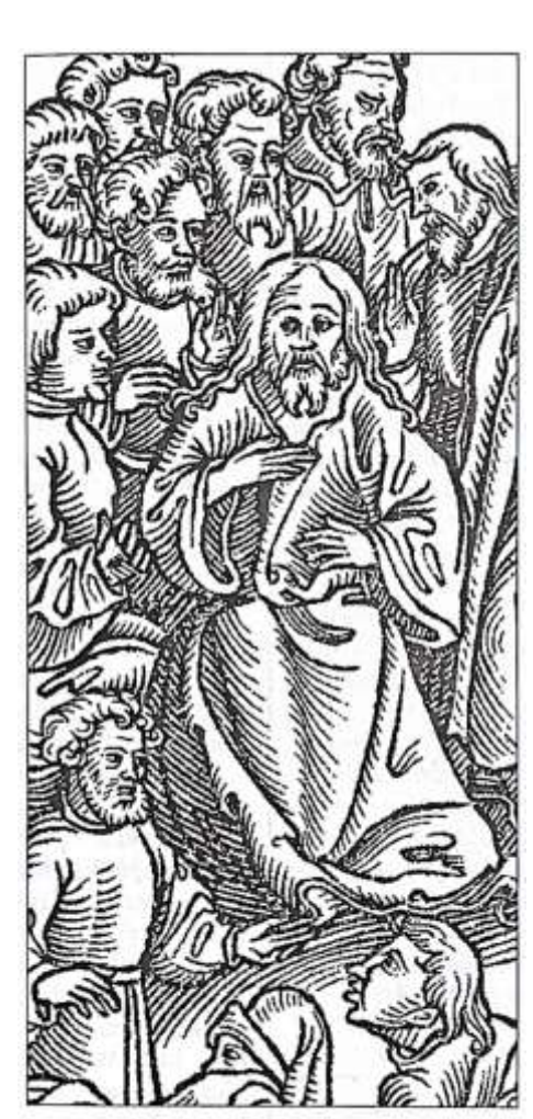
Christ Teaches His Disciples to Pray; from 1530 Large Catechism

Therefore, we can count on prayer. It doesn't depend on our holiness or worthiness, but on God's commandment. "God does not consider prayer because of the person, but because of His Word and obedience to it" (237). He will not allow our prayers to be in vain or lost, for "if He did not intend to answer your prayer, He would not ask you to pray and add such a severe commandment to it" (238).